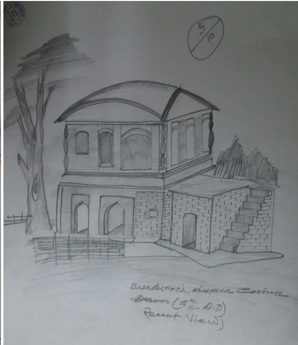
Drawing of the winners