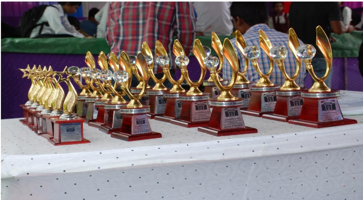
Award and Certificate Felicitation to the winners.