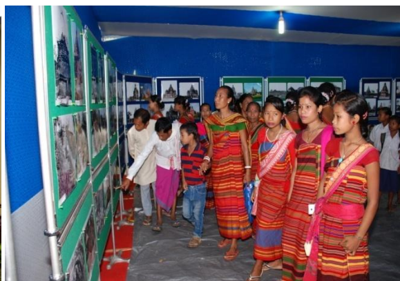
Museum Complex and Photo Exhibition