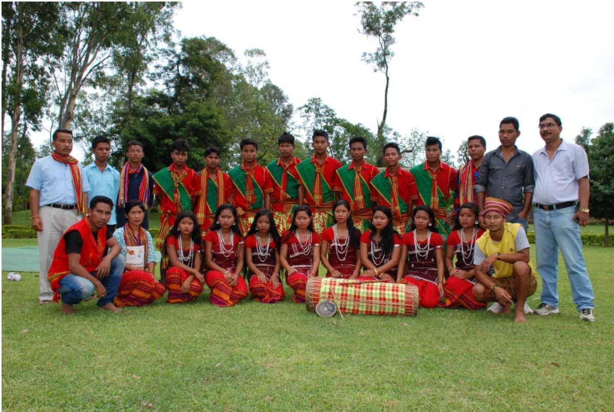
Traditional Folk Dance from Rabha Group, Banai Group and Hajong Group.