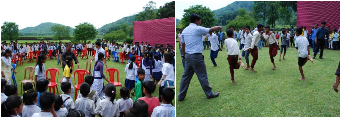
Game ( Musical Chair round and Cock Fight).